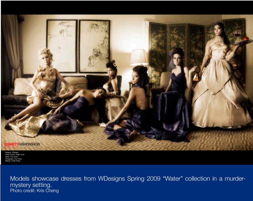
Models showcase dresses from WDesigns Spring 2009 "Water" collection in a murder-mystery setting.

W: The 01.22.10 show will premiere my Spring 2010 collection. Though specifics are still being nailed down, I'm already getting very excited to introduce my vision to the fashion industry.