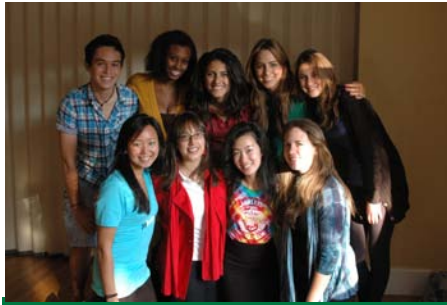
New members of the Charity Fashion Show staff team take a posing break at the 10.10.09 staff retreat.

Charity Fashion Show's Development Division is responsible for all business aspects of CFS.