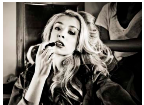
Four iconic photos that composed the modeling audition campaign this October. Lingerie credit: Candy Kitchen

Part of Charity Fashion Show's mission is to promote ethnic and cultural diversity through a more global understanding of beauty, and this year's models certainly embody that principle. We are so excited to see the amazing work they produce, and we can't wait to have fun along the way.